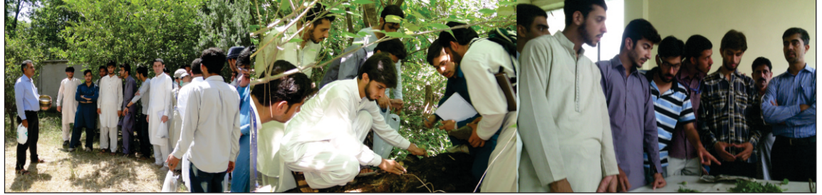
Haripur University students busy in training sessions