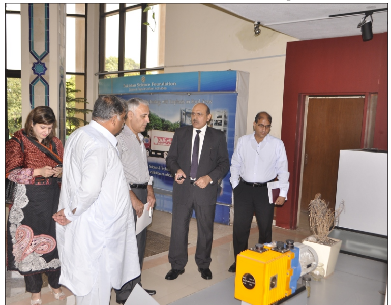
KP officers visit display of PSF funded projects outcomes during their visit to the Foundation.