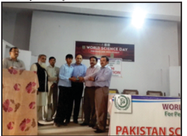
World Science Day activities of Multan Unit

occasion of World Science Day on November 10, 2016. Sixteen contestants participated in the contest. Prizes were distributed among winner students.