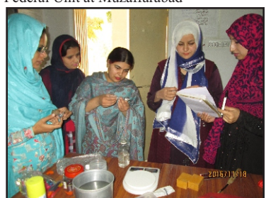
IBSE Session arranged at Rawalpindi by Federal Unit