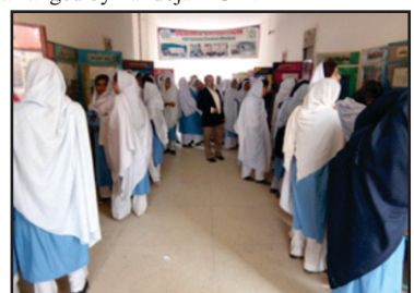
Glimpses of Science Caravan exhibition arranged by Multan Unit general public visited the Science Exhibition.

Peshawar: The Science Caravan Peshawar Unit arranged exhibitions at GCMHS-Timergara Dir (L), GHSS-Sherpao Charsada and Afridi Model School & College Peshawar on November 01-02, November 07-16 and November 24-29 respectively. A total of 3,736 students and 121 teachers from 11 schools visited these exhibitions.