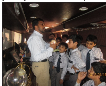
Science exhibition arranged by Federal Unit at UET, Lahore

Federal Unit: The Science Caravan Federal Unit arranged an exhibition during All Pakistan Science Fest-2017 at UET, Lahore on April 17-21 April, 2017. Over 3,850 students from 12 schools participated in the activity.