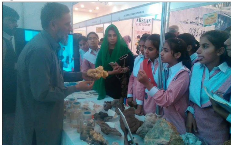
Students visit PMNH Stall during National Book Day Exhibition