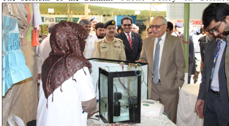
Balochistan Governor Muhammad Khan Achakzai visiting exhibition stalls at the 2 nd Invention to Innovation Summit at University of Balochistan, Quetta on April 25, 2017

Technology and Innovation, Technologies for Mines and Mineral Processing, PSF Fund Winning Opportunities, The role of Entrepreneurship in the Current Economic Scenario of Balochistan, Technologies for Renewable Energy, ORIC session on Trust Building Measures Between Academia, R&D institution, Industry and Society, Industrial Process Improvement-Productivity and Efficiency, Technologies for Horticulture – Fruits and Vegetables, Technologies for ICT Sector, Social Innovation and Social Entrepreneurship, Technologies for Marine and Coastal Sector Development, Product and Process