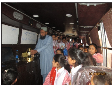
Students are being briefed about exhibits inside STFS Mobile lab during exhibition at Pak-China Centre, Islamabad

Another exhibition was arranged during National Book Day organized by National Book Foundation at Pak-China Centre, Islamabad on April 22-24, 2017, which was visited by 4,500