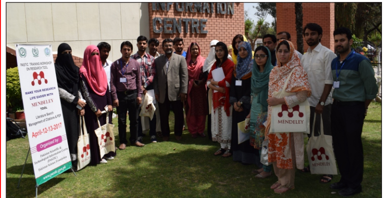
Group photo of the Participant of the Workshop

iphone etc. In order to enhance the research capabilities and to inculcate modern thesis writing trends, PASTIC National Centre regularly organizes training workshops on Mendeley. PASTIC organized a training workshop on "Make your research life easier with