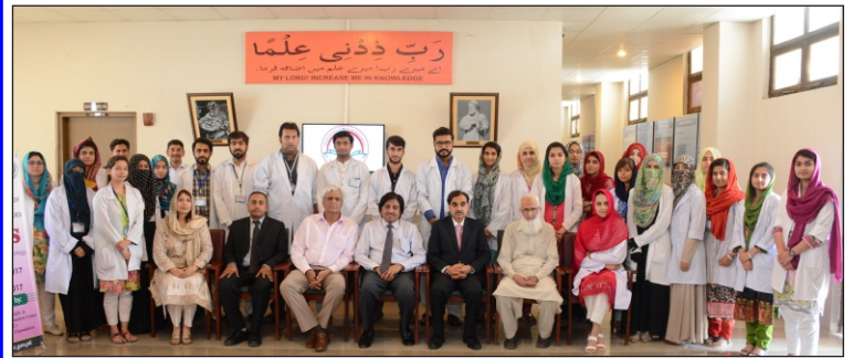
Group photo of the Participants of the Workshop

He emphasized that quantitative analysis is one of the core part of medical research field and trainings on such tools are very important for the medical students. He also requested PASTIC to conduct more trainings on the same topic as well as Citation tools like Mendeley and EndNote. The participants expressed their appreciation for organizing such need based training. Later on, certificates were also distributed among the participants.