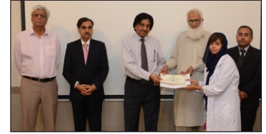
A glimpse of certificate awarding ceremony at the end of the Workshop