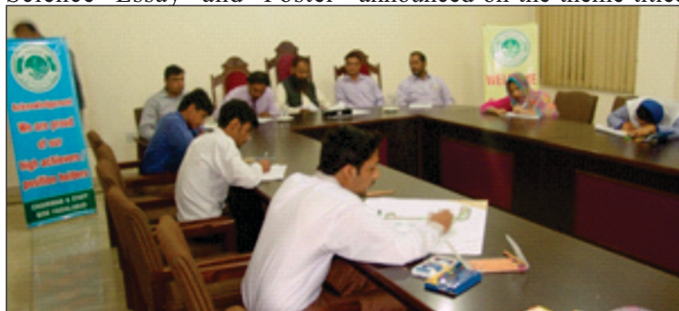
A view of Intra-Board Science Essay and Poster Competition arranged by BISEs Faisalabad and Sargodha