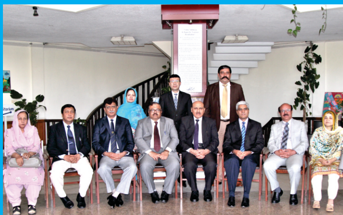
A group photo of the PSF Board of Trustees after the 47 th Meeting of the Board on April 8, 2017