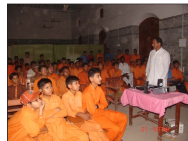
Glimpses of Science Caravan Exhibition arranged by Sukkur Unit at Shikarpur