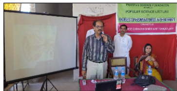
Popular Science Lecture organized by PSF Science Caravan Tandojam Unit.

with the audience and gave very informative presentation. At the end, question answer session was also arranged.