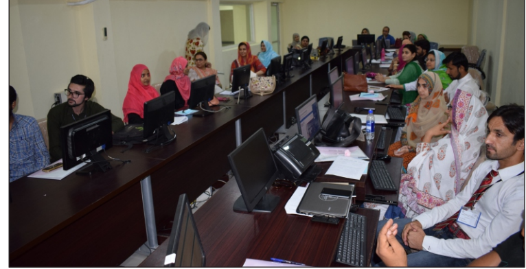
A glimpse of the Mendley Workshop at PASTIC

discovering of new research. The workshop included practical sessions, where an opportunity was provided to learn and practically use different features in Mendeley application starting from creation of Mendeley account to insertion of bibliography in Participants (student and MS Word application.