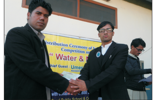
PSF Science Caravan Officials distributing Cheques among winners across the country