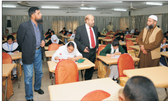
Glimpses of Essay and Poster Competitions organized by BISE Peshawar and BSE Karachi respectively