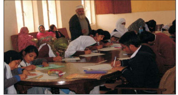
Glimpses of Poster Competitions organized by BISE Sukkur and Sargodha respectively

students about disadvantages of unnecessary and over usage of mobile and internet, the theme announced for PSF's 24th Intra Board Science Poster Competition is