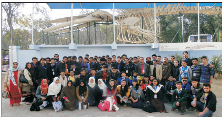
Group photo of the Intel National Science Competition participating students and teachers with PMNH officials on 30th January.

Intel Pakistan organized National Science Fair in association with Pakistan Science Foundation at Sir. Syed Memorial Complex, Islamabad. Some 197 young students from different schools and colleges of the country participated in the National Science Fair by submitting more than 94 science projects. At the end