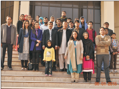
Group Photo of students with Chairman, Senior Officers of PSF and PTV Team

PSF liaise with print and electronic media for promotion and awareness of its science propagation activities. Talk Shows/Interviews on TV