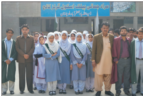
Group Photo of Students and Teachers with PSF Science Caravan Team-Jaffarabad

Science Caravan Jaffarabad unit arranged Science Caravan Exhibition at Murad Public School Dera Allah Yar District Jaffarabad on 13.01.2015. 285 students and teachers participated in the Exhibition.