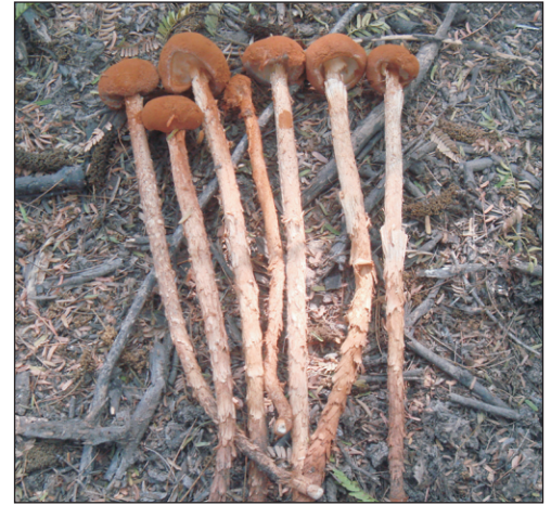
Specimen of Fungi studied at Umerkot-Sindh

groups from the Pae forest, Sakrand, Nawbashah, Miani forest, Hyderabad, Sindh Agriculture University Tandojam, Umerkot, Mirpurkhas and Jamshoro areas. During the 11 days' field survey the research team also met with many scientists and students to brief them about the role of PSF/PMNH in the country in raising awareness about the natural wealth and its conservation in the various remote areas of the country.