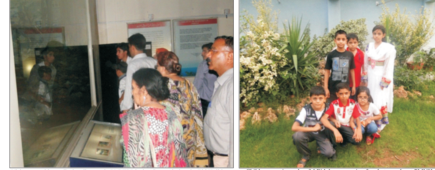
Visitors watching a display diorama in PMNH Display Centre during the Eid Holidays

The Display Centre of to the visitors during the of the Museum. The visitors towns and were highly PMNH remained opened holidays. PMNH officers expressed their thanks to impressed by huge natural from 0800hrs to 2000hrs for and staff members PSF and PMNH for history repository of the public from the second facilitated thousands of providing such important Pakistan. A large number of day of Eid-ul-Fitr. Special men, women, students and scientific information and families and media arrangements were made to youngsters and briefed them non-formal education. personnel also visited the provide entertainment as about display halls, galleries Many of the visitors were display galleries showed well as informal education and natural history dioramas coming from other cities and keen interest in PMNH.