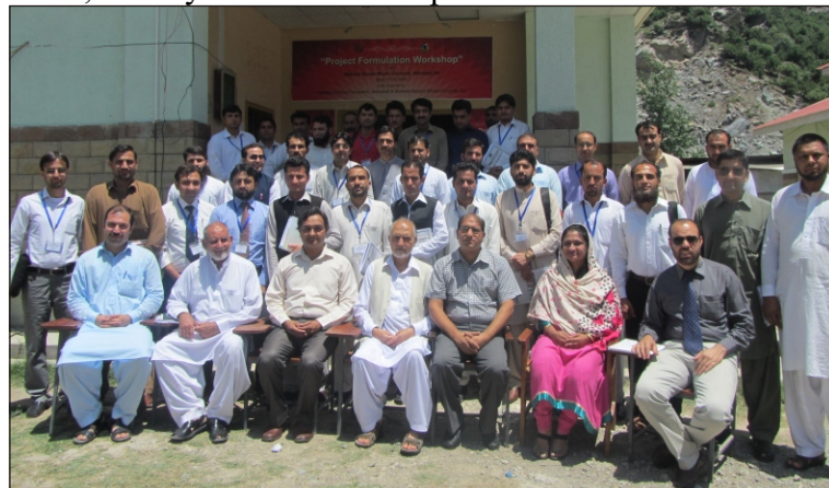
Group photo of the Participants of the Workshop