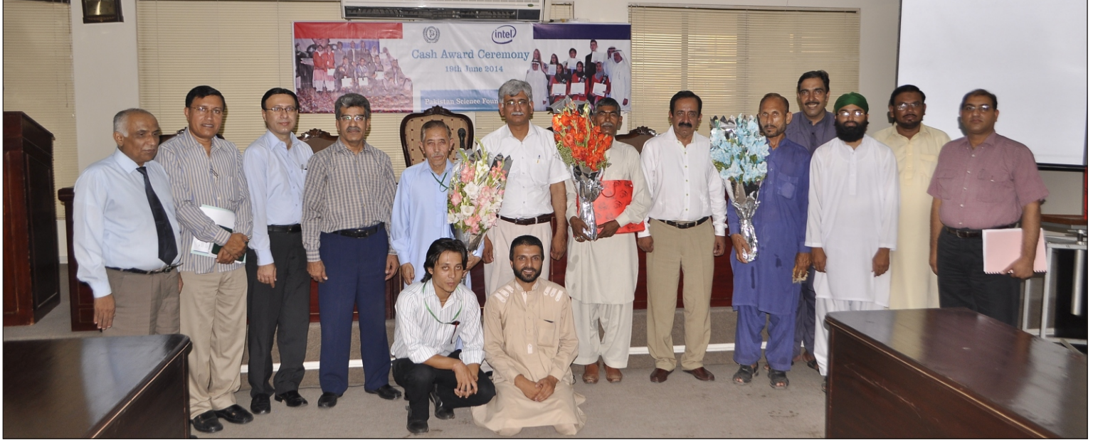
Group Photo of retiring officials with Chairman, PSF