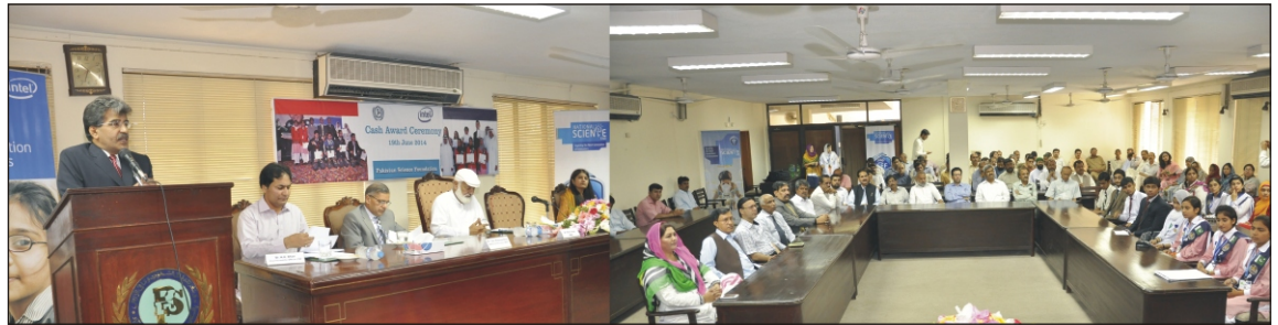
The Chairman, PSF addressing the audience during the Cash Award Ceremony

PSF and Intel Education have been joining hands for creating science culture among the youth since 2002, for which Provincial and National Science Fairs are organized on regular basis. PSF provides expertise of its scientists for mentorship and evaluation of the students' projects. The national winners also participate in Intel International Science and Engineering Fair (ISEF) held