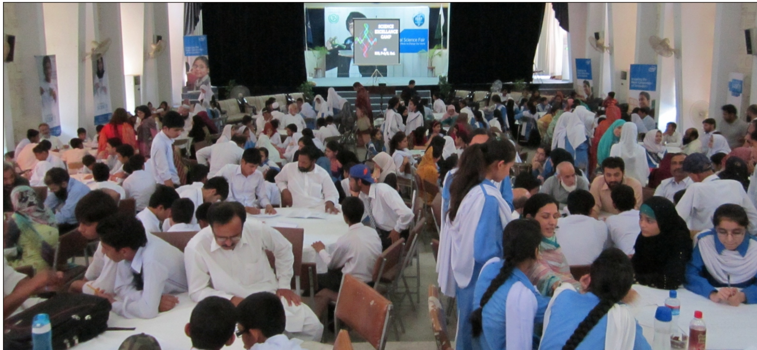
Mentors/Subject Experts busy with the students and teachers during Science Excel Camp at Islamabad

both organizations also other activities for creating society including organizing International Science Fairs. collaborate in a number of science awareness among the provincial, national and