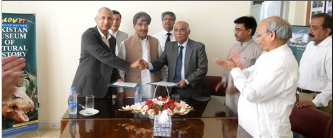
MoU signing ceremony at PMNH