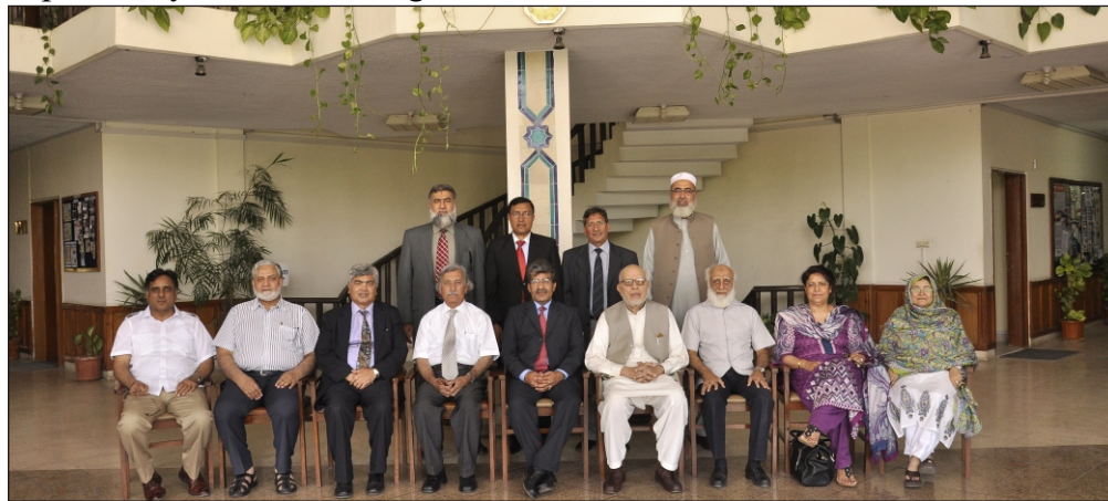
Group Photo of BoT Members