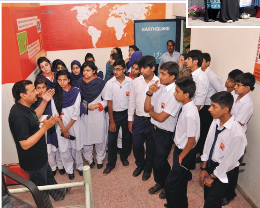
Teacher guide explaining about Earthquake exhibit to students