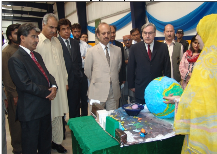
Dignitaries, Scientists and general public visiting the Expo

The International Traveling Expo "Water at the Heart of Science" was jointly organized by France and Pakistan. It started its voyage on 6 May from Islamabad to Sargodha, Mirpur (AJK), Peshawar and closed at Quetta on 12 June. Now the Expo will go back to France for its next destination. It caught attention of more than 16,200 students, teachers and general public.