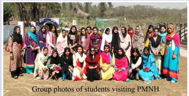
Group photos of students visiting PMNH