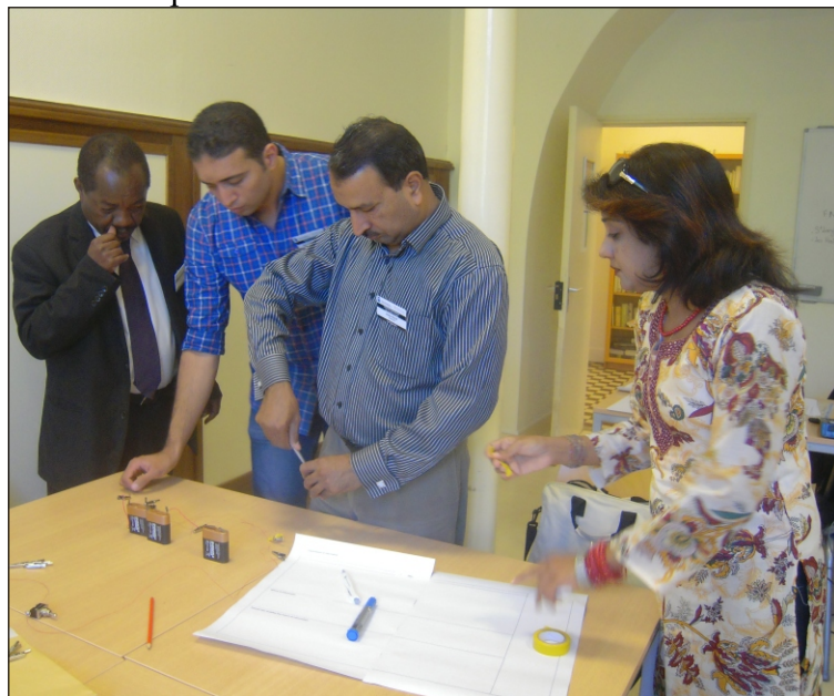
Participation in Seminar activities