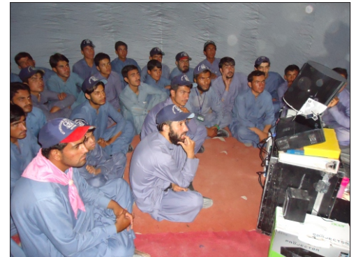
Glimpses of students visiting science exhibitions in Quetta