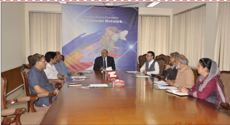
A view of meeting with USAID officials