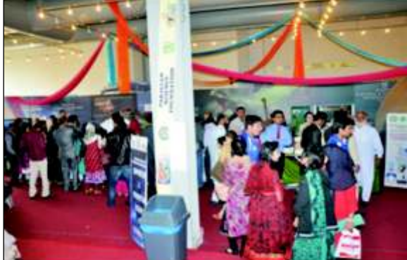
A view of PSF, PASTIC and PMNH Joint Stall during S&T Expo.