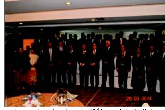
A group photo of participants of 2<sup>nd</sup> National Quality Policy Forum with Federal Minister for S&T Mr. Zahid Hamid.

Ministry of Science & remarks and welcomed all participants and also and social development of Technology (MoST) stakeholders. Mr. Zahid highlighted the need of Pakistan. He also realized organized a Forum on Hamid, Federal Minister of import and export products the importance to meet "Finalization of National S&T addressed the to accelerate the economic quality and regulatory