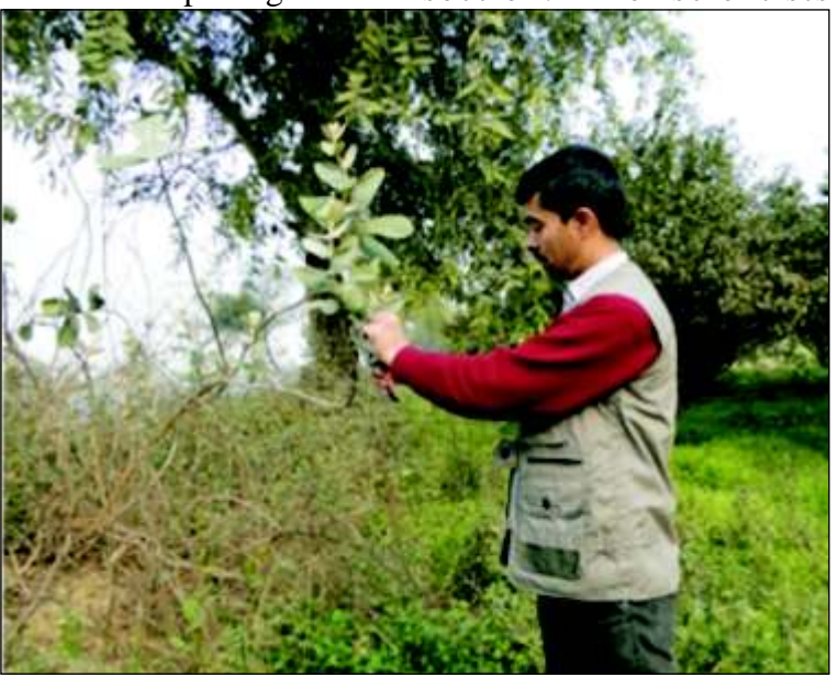
Plant Collection during field work.

changes in the fauna of localities in a geological collected 200 vertebrate the indigenous plants along Siwaliks and putting all fossil section. The scientists fossils specimens of with the precious medicinal