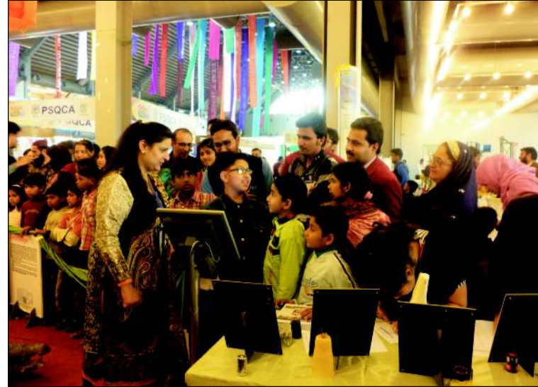
Students taking part in Quiz Competition using touch screen monitors.

working dinosaur models, March 3, 2014. The Expo display of PMNH specimens was visited by nearly 30,000