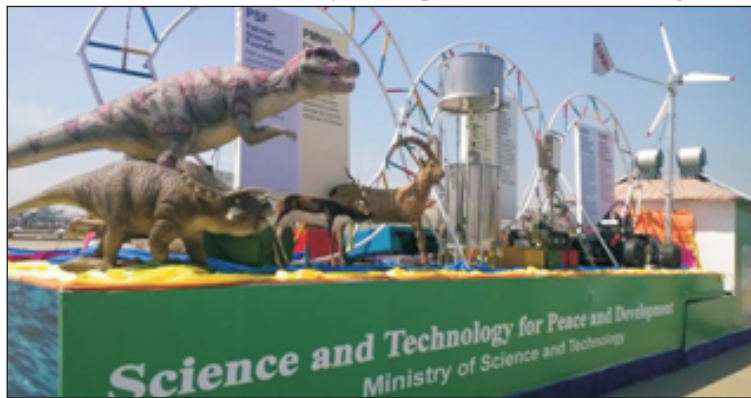
MoST Float showcases S&T Achievements during Pakistan Day Parade on March 23, 2015