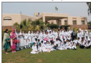
A group photo of the students and teachers at Science Centre, Faisalabad