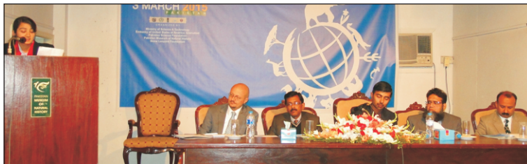
Judges evaluating the students' speech competition on World Wildlife Day on 3rd March at PMNH