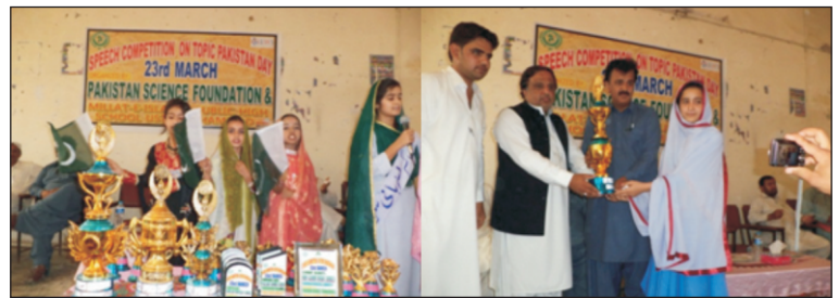
Pakistan Day Celebration by Science Caravan Jaffarabad Unit