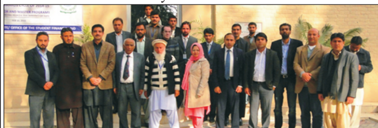
Group Photo of DG, PMNH and Director and officers of Earth Sciences Division, PMNH, with Faculty of Department of Geology, University of Haripur