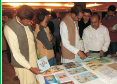
PSF stall at SASI Launch & Educational Marketplace

The School Assessment for School Improvement (SASI) with an emphasis on showcasing SASI's one year journey, SASI's 7th Marketplace event was held on March 26, 2015 at Ramada Hotel, Islamabad. They also invited PSF for arranging its stall on this occasion. The PSF set up a stall showcasing some scientific literature provided by the Foundation to schools.