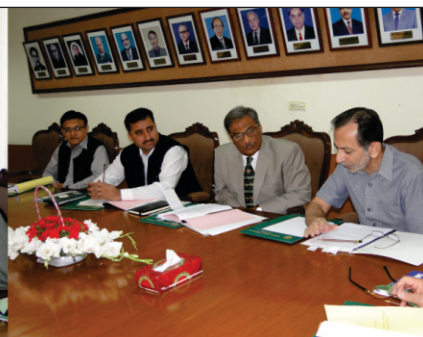
Glimpses of the 7th meeting of PSF Board of Governors at PSF on June 22, 2017.

Four Pakistani Students Participate in "9 th Kocaeli International Child and Science Festival"