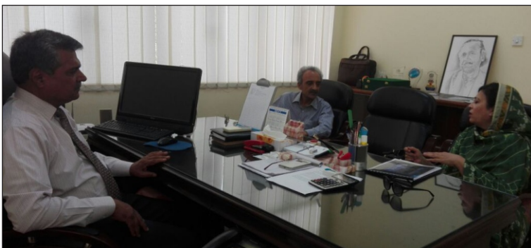
Meeting with Director NMST Lahore