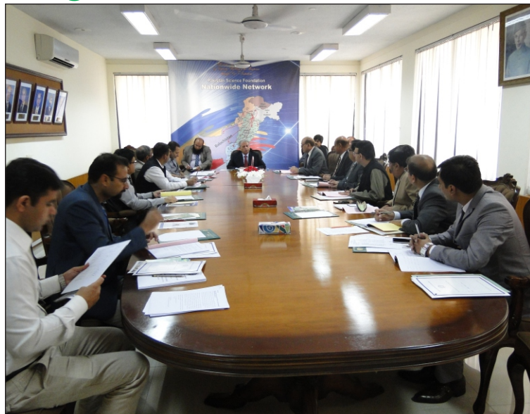
Federal Minister for S&T Rana Tanveer Hussain chairs 7 th meeting of PSF Board of Governors at PSF on June 22, 2017.

The meeting commenced with the recitation of the Holy Quran. Thereafter, the Chairman BoG, the Federal Minister for Science and Technology welcomed and thanked the members for sparing time to attend the meeting.