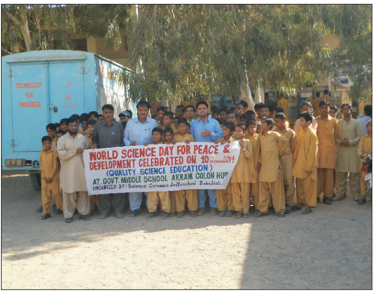
The Theme of World Science Day Highlighted by Jaffarabad Unit