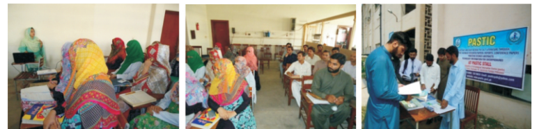
Glimpses of Seminar on PASTIC S&T Services at the Agriculture University Peshawar

PASTIC Sub-Center Peshawar organized a one-day Seminar "PASTIC S&T Services for Researchers" at Department of Agriculture Chemistry, Agriculture University Peshawar, on September 25, 2017. Deputy Director PASTIC-Peshawar shared PASTIC/PSF S&T activities with the participants in detail through PASTIC web page & also having short practical brief on research methodology adopted by PASTIC through online data bases. A total 27 students attended the seminar and took keen interest in the presentation.