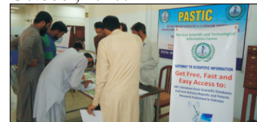
Students at PASTIC services stall at Agriculture University Peshawar

PASTIC regularly organizes its service stalls all over the country, wherein PASTIC publications are displayed and membership forms/pamphlets are distributed and the visitors are briefed about PASTIC services. In continuation of this regular activity following stalls were organized during the month of October.