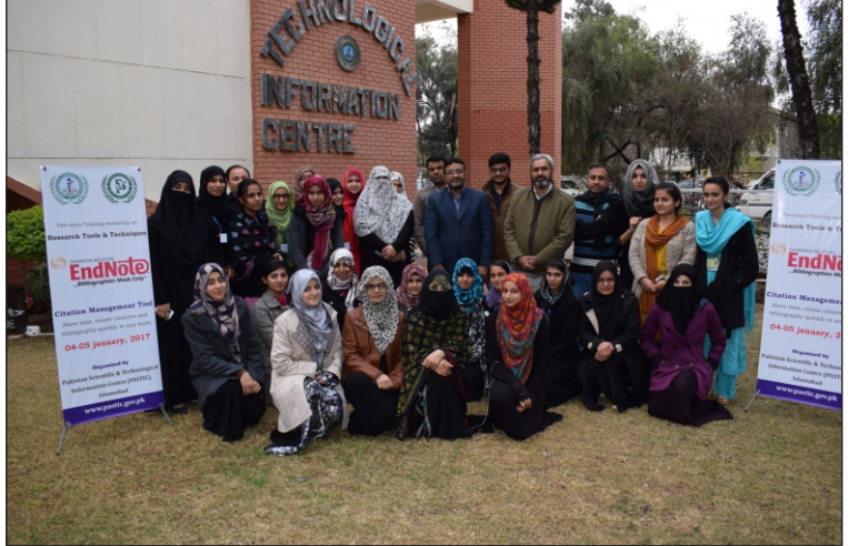
Group Photo of the Participants along with resource Person