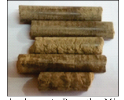
development. Presently, M/s Waste Buster is also producing RDF pellets which are burnt like coal.

So, the next phase of this technology is to obtain gas from municipal waste. In this case, despite incinerating the RDF pellets, gas will be obtained from MSW to be used for heating purposes in different industries. The private sector party M/s Waste Busters Ltd. has consented to contribute 30 percent of the total cost of the project and will be the end-user of the technology after its successful