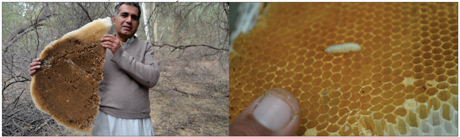
A hive with wax moth collected during the field study tour to Lal Suhanra National Park, Bahawalpur

optimum temperature of about 3 2 C they reach full development about 19 days after hatching. At cooler temperatures, and when food is scarce, the larval period may extend to 5 months.