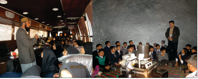
Students being briefed about exhibits inside STFS Mobile Lab and planetarium show at Dina

Peshawar: The Science Caravan Khyber Pakhtunkhwa Unit arranged science exhibitions at GHSS-Billitang Kohat and GHS-1 Nowshera on January 23-28 and January 30-31 respectively. Two Popular Science Lectures were also arranged at Govt.