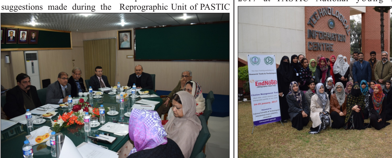
A glimpse of consultative meeting on revamping of PASTC

Centre, Quaid-e-Azam University Campus Islamabad. The objective of this workshop was capacity-building of young researchers and