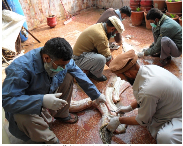
ZSD staff skinning the Python specimen