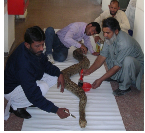
Finishing touches being given to the stuffed specimen of Python at PMNH Taxidermy lab for display.

A dead specimen of Indian Rock Python Pythus morulus (Pythonidae: Squamata) was collected from the vicinity of Islamabad by PMNH Zoological Sciences staff including Imran Abbas, Collection In charge and Khuram Hussain, Skeleton Preparator on January 1, 2016. The specimen of female python was 11½ feet long and 50 kg in weight. It's skinning and stuffing process was carried out at Zoological Sciences Division. It is first ever longest