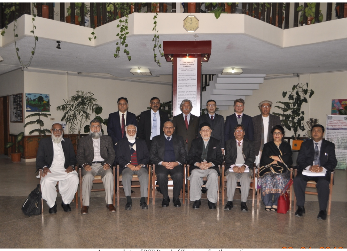
A group photo of PSF Board of Trustees after the meeting.

Pakistan Science Foundation is making strenuous endeavors to introduce innovation in this sector through its Research Support and Natural Sciences Linkages Programmes. PSF is offering funding for projects aimed at agriculture sector development through science and technology. It is need of the hour that scientists may come forward and submit needbased research projects to convert our un-utilized land into green fields of crops, gardens and orchards and contribute to our national economic development.