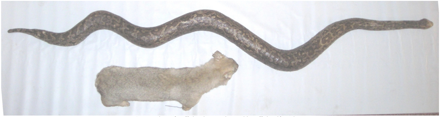
A comparison of stuffed python specimen with stuffed wolf specimen

specimen of Python added to PMNH collection.