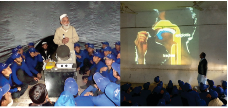
View of Science Exhibition arranged by Peshawar Unit

Peshawar Unit: The Science Caravan Peshawar Unit arranged exhibitions at Govt. Shaheed M. Ghassan Centennial Model High School-1 and Govt. Shaheed Behram Ahmad Khan Higher Secondary School Serai Naurang District Lakki Marwat on January 04-13 and January 14-24, 2016 respectively. As many as 6,043 students and 151 teachers from 42 schools participated in these exhibitions.