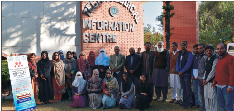
Group photo of participants of workshop of Mendeley tools at PASTIC

The workshop included practical sessions where in an opportunity was provided to learn and practically use different features in Mendeley application starting from creation of Mendeley account to insertion of bibliography in MS Word application.