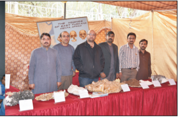
World Science Day Celebration in PMNH

School, Daulatpur on dated November 11, 2017.