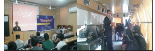
Science Caravan exhibition arranged by Faisalabad Unit

Faisalabad Unit: The unit arranged science exhibition in Diliwala, Mianwali on November 13-24,