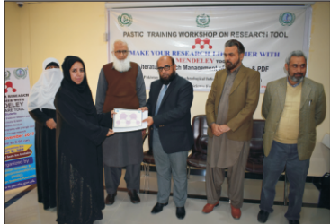
Participants receiving certificates after completion of Mendeley tools training at PASTIC

In order to enhance the research capabilities and to inculcate modern thesis writing trends in researchers, PASTIC regularly organizes training workshops