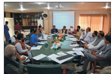
Librarians participating in group discussion during consortium

National Centres of Excellence and Scientific organization will be abridged to create latest library tools for resource sharing.