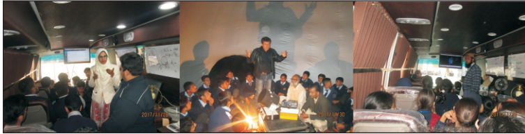
Glimpses of exhibitions arranged by the Federal Unit

Federal Unit: The Science Caravan Federal Unit arranged science exhibition at Educators, G-11 Campus, Islamabad on