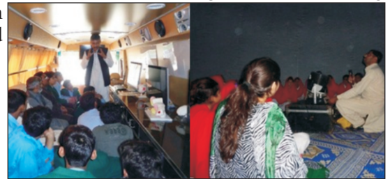
Science Caravan exhibition arranged by Multan Unit

The Science Caravan Federal Unit arranged teachers training session on Inquiry Based