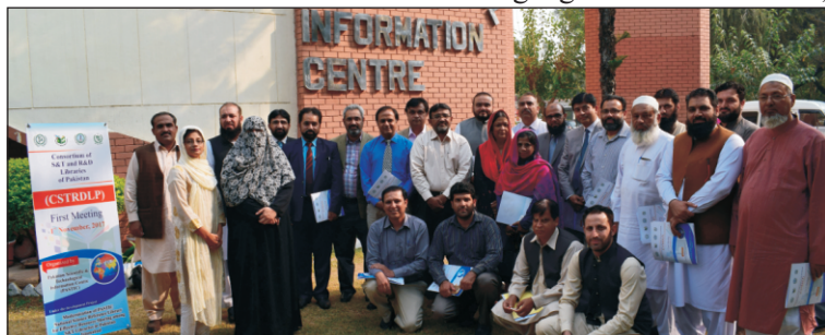
Group photo of the participants of the Library consortium held at PASTIC

Library for Effective Resource Sharing among S&T libraries in Pakistan" has been approved. One of the core objectives of this project is to develop consortium of S&T as well as R&D libraries of Pakistan (CSTRDLP). Through this consortium all the central, national and departmental libraries belonging to universities,