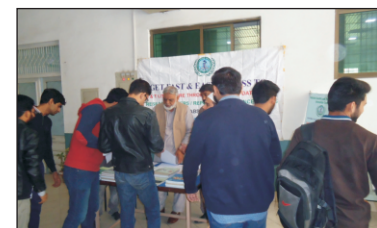
Students at PASTIC Services awareness stall at department of Mechanical Engineering, University of Engineering and Technology Lahore

At department of Chemistry, University of Baluchistan Quetta on 16th Nov. 2017.