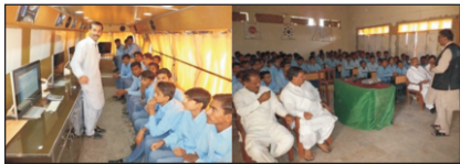
Glimpses of Caravan Exhibitions arranged by Tandojam Unit

Tandojam Unit: The Tandojam Unit arranged a Science Caravan exhibition at GBH School Taluka Daulatpur district Shaheed Benazirabad on November 06-11, 2017. About 1,445 students and 41 teachers from nine schools visited the exhibition.