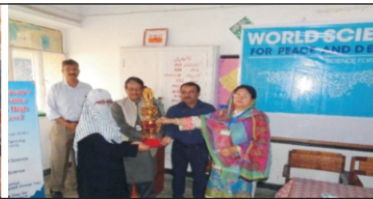
World Science Day Celebration by Multan Unit